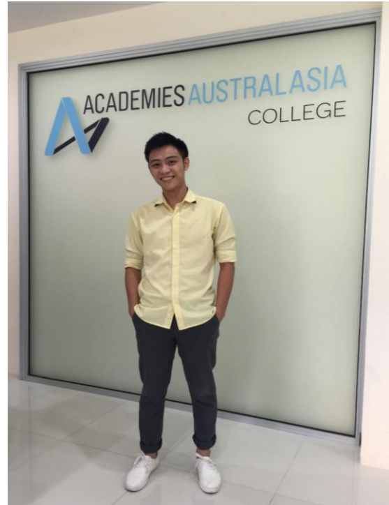
An example of a neat and correct way of a student's dress code in AAC