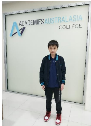
An example of a neat and correct way of a student's dress code in AAC